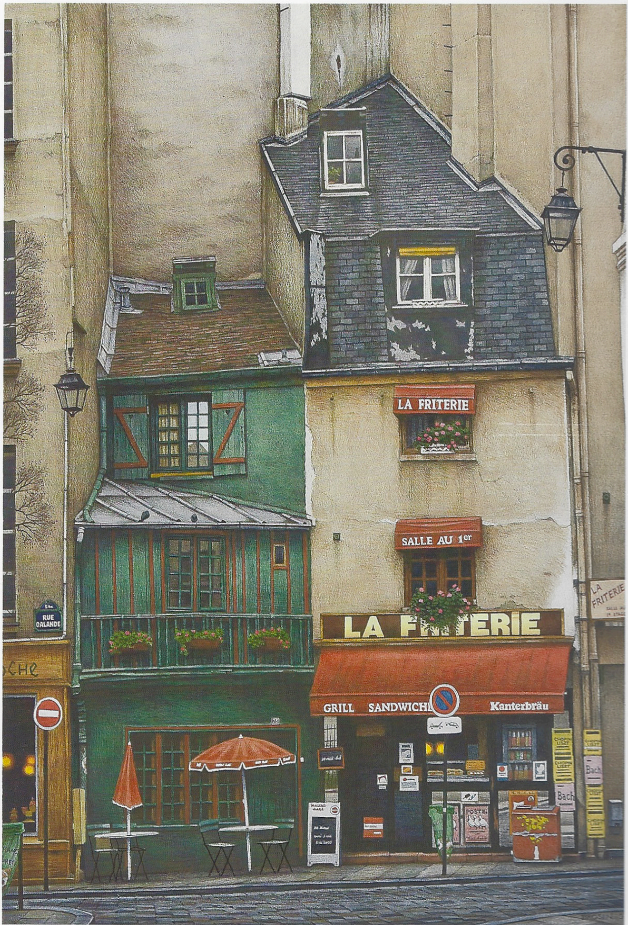
La Friterie, Paris, 2010