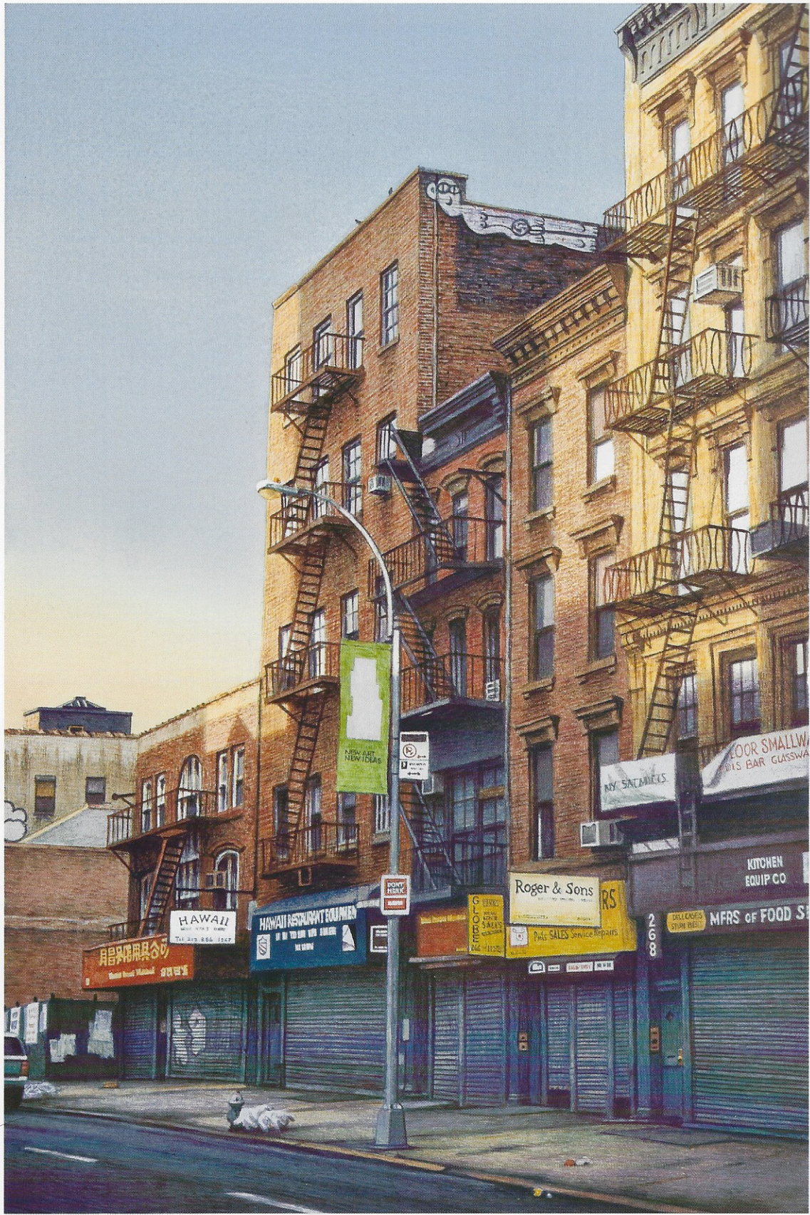
The Bowery between Houston and Prince Streets, 2010

Watercolor over graphite on paper, 17 x 11 1/2 in.